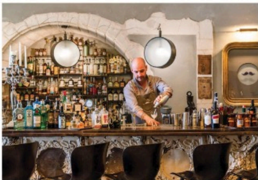
Lounge Bar 700, Paragon 700, Ostuni

Our first meal at Paragon 700 was lunch under the pergola near the pool, where I dined on a simple yet refined dish of linguine with tiny shelled clams finished with basil oil. It was so exquisite that we decided to return for dinner the next night. In the evening, lanterns transformed the property. We dined outside, where we enjoyed a sophisticated multicourse meal that included decadent gnocchi and a perfectly cooked turbot fillet served with fresh vegetables. It turned out to be one of the most romantic and delicious meals of our entire trip. The pool, soundtrack aside, ended up being a relaxing escape during the hottest part of the day. In addition, the one-room spa in the palace's former cistern, accessed by a hidden staircase, is surprisingly impressive for such a tiny space, with a steam room, a hydromassage tub and treatments such as