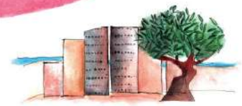
LA FIERMONTINA OCEAN Larache