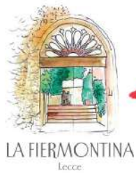
LA FIERMONTINA Lecce