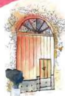
M.A.M.A. family museum Lecce