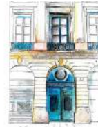
LA FIERMONTINA VENDÔME Paris