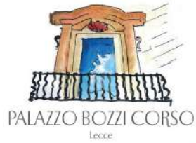
PALAZZO BOZZI CORSO Lecce